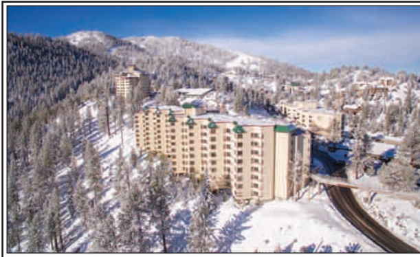
STATELINE, NV – The beautiful surroundings of The Ridge Tahoe atop Kingsbury Grade overlooking the Carson Valley and the nearby snow-filled ski trails. Getting to those trails is easy with the Hilltrac Skier Express.

The Ridge Tahoe is the perfect location for your next family ski or summer vacation. It offers a health club, indoor sports complex, indoor/outdoor swimming pool and Jacuzzis, racquet-