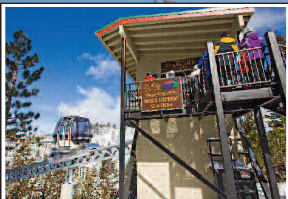
Ski-in - ski-out at Ridge Tahoe on the self-operated Hilltrac Skier Express lift.

Call 1-800-334-1600 • www.RidgeTahoeResort.com