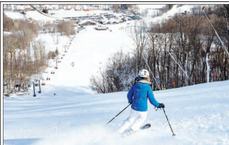
EGREMONT, MA - A beautiful cruise down one of many perfectly groomed trails at Catamount heading to the large and inclusive base facilities. Just 2.5 hours from New York City, Catamount offers 44 trails with 93 percent snowmaking on 1,000 feet of confidence building vertical. They have night skiing/snowboarding on 13 trails and two terrain parks.

If you are not a skier or snowboarder, Berkshire East also offers a Snow Tubing Park with three 500-foot-long tubing lanes and a Magic Carpet to bring you back up to the top fast. Snow tubing, a great introduction to winter activities, is fun for almost any age and is great for groups.