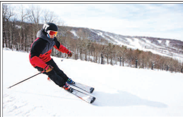
EGREMONT, MA - A beautiful cruise down one of many perfectly groomed trails at Catamount with a view of the expansive network of terrain and trails in the background. Just 2.5 hours from New York City, Catamount offers 44 trails with 93 percent snowmaking on 1,000 feet of confidence building vertical, plus night skiing, terrain parks, and snow tubing.

Berkshire East offers plenty of base area facilities to warm up and relax off the slopes. The Main Lodge offers three dining options, including a grab-and-go window for those who want to hang out around the fire pits on the patio before heading back to the lifts, a quick service cafeteria with plenty of