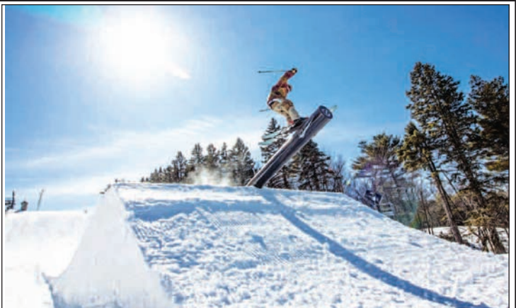
POCONO MOUNTAINS, PA - Sliding a rail at JF/BB, this skier is having a fun blue sky day.

All six ski resorts feature rentals and dedicated local in-