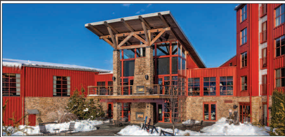
MACUNGIE, PA - Bear Creek Mountain Resort is home not only to a great ski, snowboard and tubing mountain but also a great hotel, conference center and wedding venue.