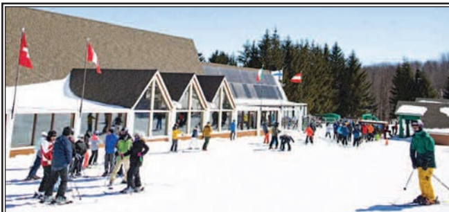
UNIONDALE, PA – Elk Mountain is an independent mountain dedicated to great grooming and snowmaking. It is a big mountain experience without the drive. Scan the QR in the ad to buy lift tickets online.

The original T-bar was replaced with a chairlift in 1969, and the J-bar was retired for a double chairlift in 1973. Skiers saw Elk in a whole new light when, in 1966, lighting was installed on the East and West slopes for night skiing. Lighting was installed along three summit trails in 1972. Now a large number of trails are lit for night skiing, including the entire beginner area.