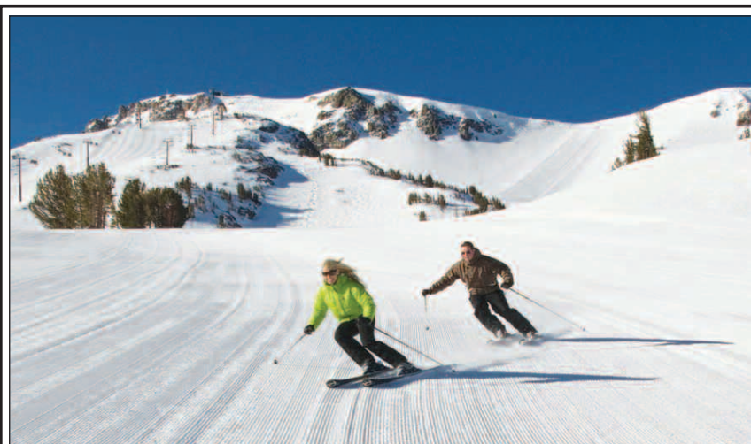
MAMMOTH LAKES, CA – Beautifully groomed trails are plentiful and satisfy the cruising thirst of any skier or snowboarder at Mammoth Mountain. Whatever the terrain you prefer, steep, deep or groomed to perfection, you will enjoy your day even more when you stay at one of the fine lodges mentioned in this article.

You will have access to the entire Mammoth Mountain at the nearby Canyon Lodge, less than 200 yards away. The gondola at Canyon Lodge also provides free daily transportation to The Village at Mammoth for recreation, shops