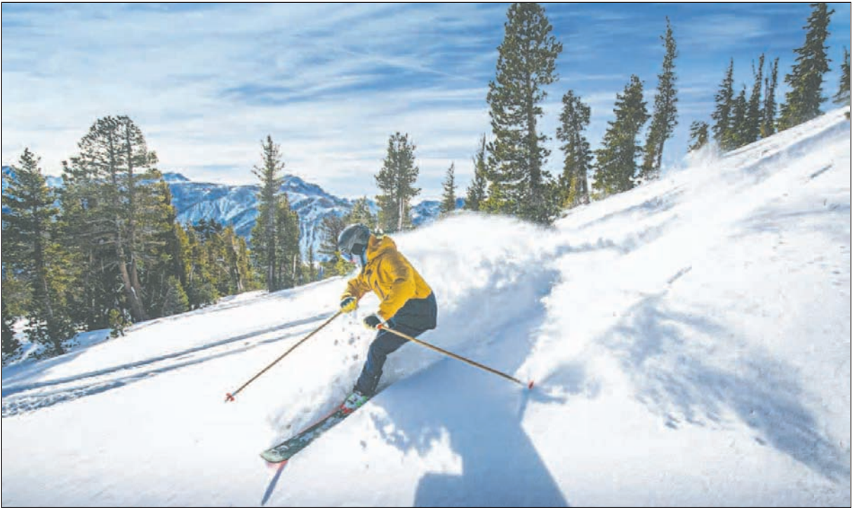
MAMMOTH LAKES, CA - You will find steep trails, great cruisers and everything in between at Mammoth Mountain in California. With a direct flight via United Airlines from Denver (DEN) to Bishop, Calif., (BIH), which is a short distance to Mammoth Lakes, you can easily get to this Unreal ski destination from major U.S. hub airports. Mammoth received more than 700 inches of snow in the 2023-24 winter season which lasted until August 6th. Powder days as well as cruising days were plentiful.

Did we mention that the mountain got over 300 inches more snow than average in 2022-23? Add in Mammoth Lakes' average of 275 days of sunshine per year and that equals an unreal alpine destination. Where else can you barrel down a powder-soft mountain while the California sun