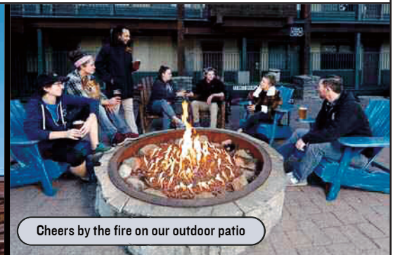
Cheers by the fire on our outdoor patio