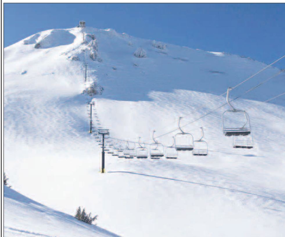
MAMMOTH LAKES, CA – Mammoth has deep powder and groomed runs for everyone. Winter 2018-19 was a great snow year and the resort kept skiing until late July. There is every indication that this will be a very good year as well. Do not be left out, book early and often, and we will see you on Chair 23, shown here.

Their new double-king chalet is the ultimate lodging facility with two king bedrooms, fold out couch in the living