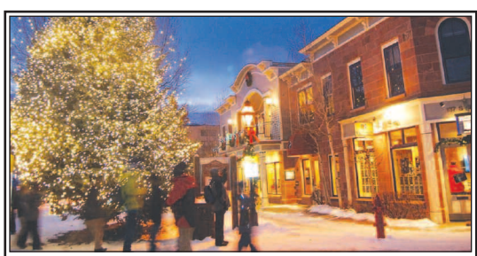
Breckenridge, CO - Peak Property has all the best places to stay for skiing and for town events like the "Lighting of Breckenridge" pictured above.

BRECKENRIDGE, CO – If you had the opportunity, would you call a friend that knew all about your next vacation destination?