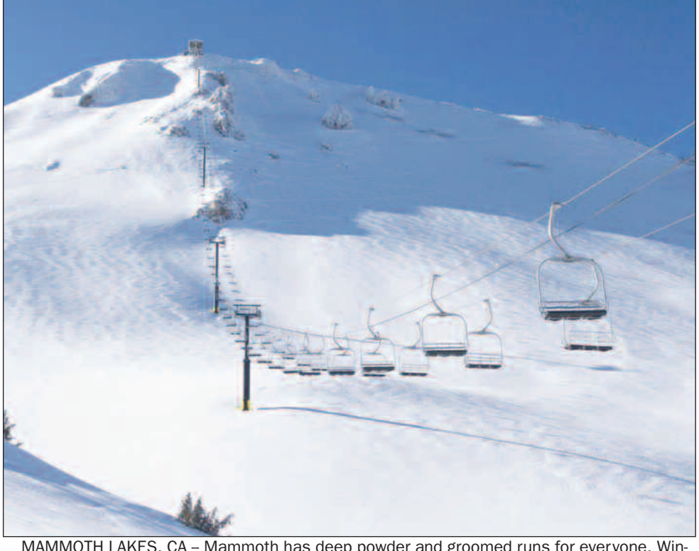
MAMMOTH LAKES, CA – Mammoth has deep powder and groomed runs for everyone. Winter 2023-34 saw more than 700 inches for a spectacular snow year. The resort kept skiing until August 6. There is every indication that this will be another very good year as well. Do not be left out, book early and often, and we will see you on Chair 23, shown here.

In 2015, Holiday Haus opened the "Casitas." They are perfect for a family trip. They have one king bed, pull out couch and full kitchen. They provide great space for family and friends at reasonable prices.