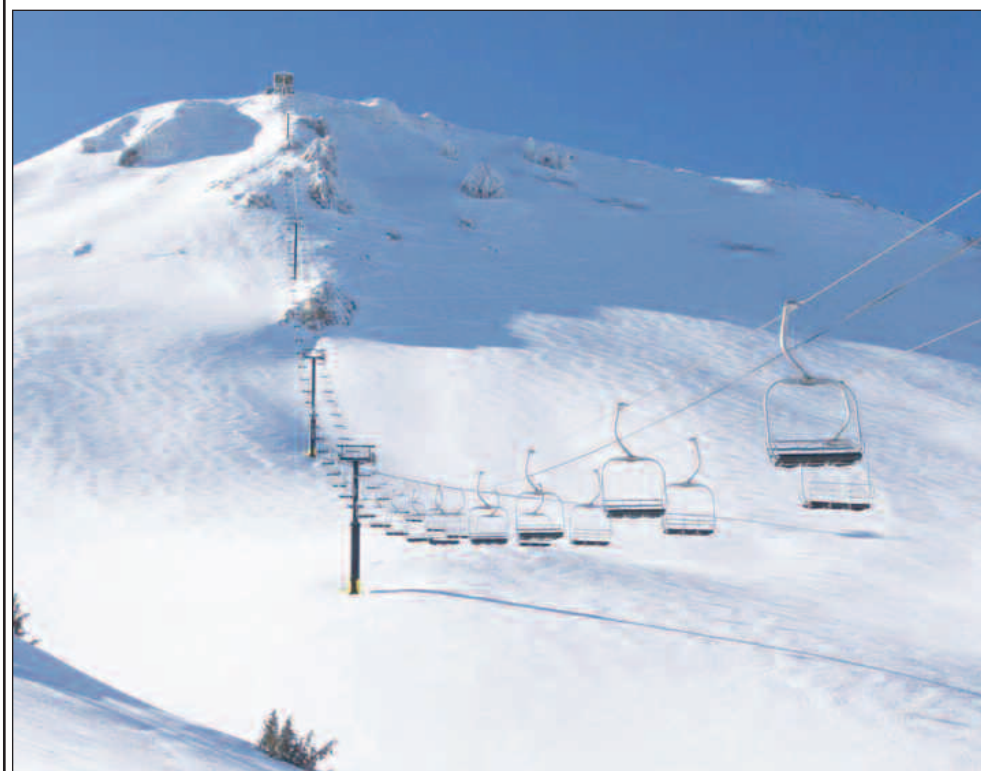
MAMMOTH LAKES, CA - Mammoth has deep powder and groomed runs for everyone. Winter 2023-24 saw more than 700 inches for a spectacular snow year. The resort kept skiing until August 6. There is every indication that this will be another very good year as well. Do not be left out, book early and often, and we will see you on Chair 23, shown here.

In 2015, Holiday Haus opened the "Casitas." They are perfect for a family trip. They have one king bed, pull out couch and full kitchen. They provide great space for fam-